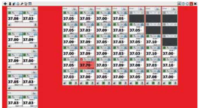
Display alerts and manage alarm notifications for any incubator connected to the system.