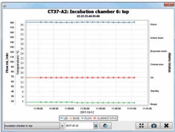
Real time graphical display of each incubator's performance.