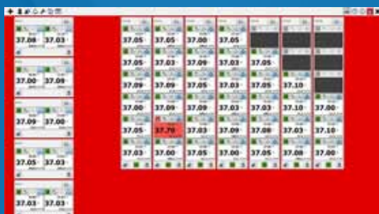
PIMS desktop in alarm