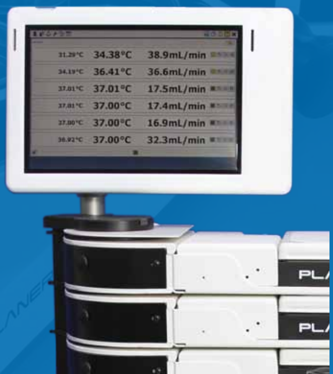
PIMSsolo unit mounted on a CT37stax™ system