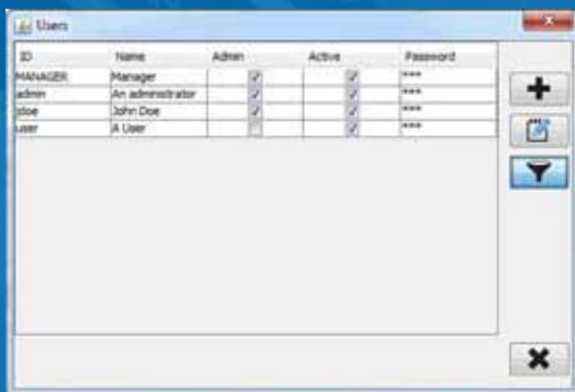
PIMS user management